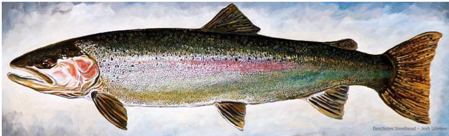
Deschutes Steelhead - Josh Udesen