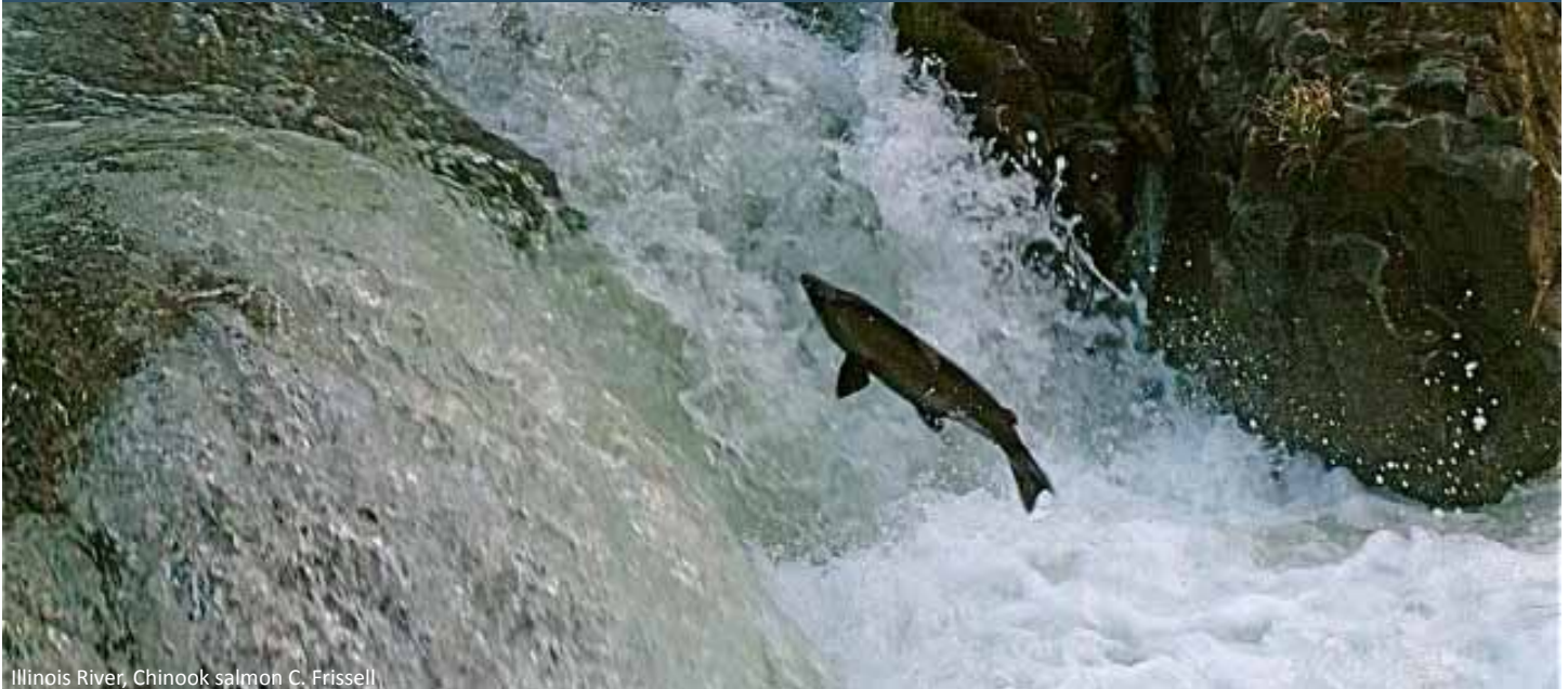
Illinois River, Chinook salmon