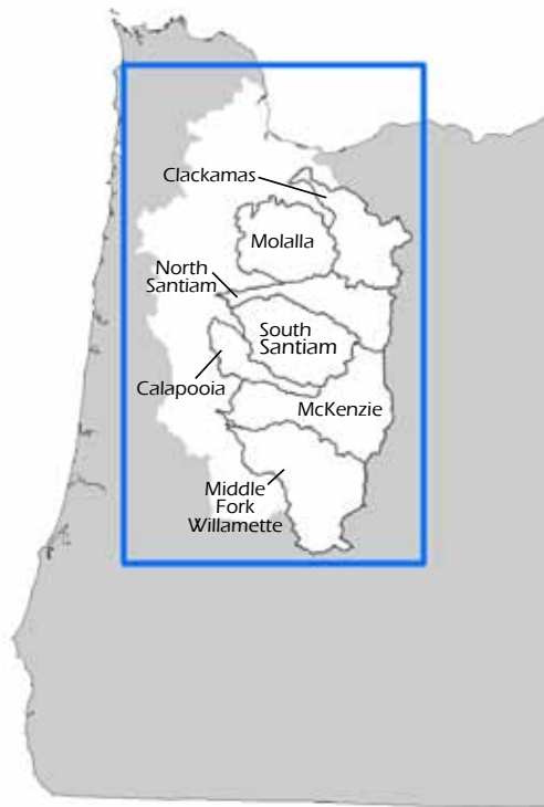
Maps courtesy of UW Recovery Plan, 2011