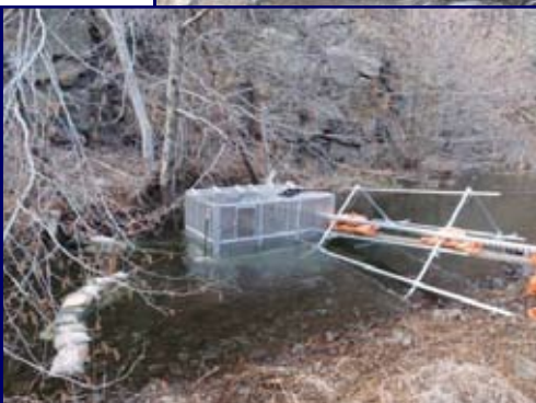
The recently constructed hatchery fish exclusion weirs at the mouths of Bakeoven (top) and Buck Hollow (left) will mean more wild steelhead in the Deschutes River.

BACKGROUND: ODFW and the U.S. Fish and Wildlife Service proposed constructing fish weirs on Bakeoven and Buck Hollow creeks and to evaluate the impact of hatchery fish on wild steelhead. Their proposal was rejected for BPA funding four years in a row even though it had been approved by independent scientific review and is consistent with the Fish and Wildlife Program of the Power Planning and Conservation Council and called for in the 2000 Columbia River Biological Opinion.